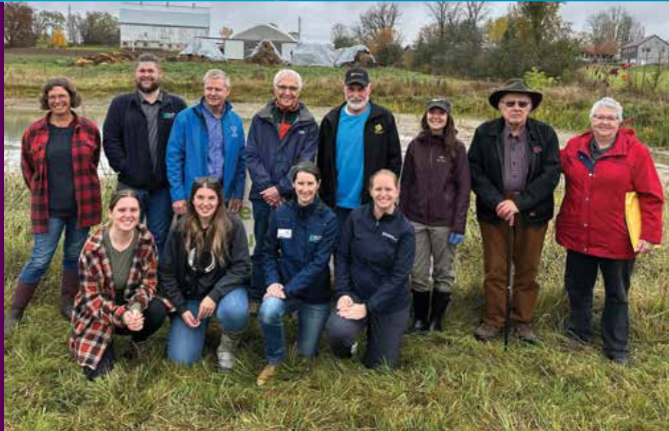
ALUS Lanark partners and participants gathered at Milkhouse Farm + Dairy on Oct. 21 to celebrate the new program's early accomplishments.