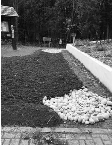
The newly constructed rain garden is ready for planting of native plants and flowers this May.

The RVCA will plant 115,000 healthy young trees this spring through the City of Ottawa's Green Acres Program. Why is tree planting important? Besides improving the look of the land, trees increase forest cover, improve wildlife habitat, increase biodiversity, protect from soil erosion, play a huge part in water conservation and water quality and act as windbreaks for people and livestock and so much more. Once mature, a forest provides lumber, firewood, nuts, fruit and maple syrup. Trees mitigate climate change by absorbing CO 2 and producing oxygen. To take root next spring (2019) you need at least one acre of land and be willing to plant at least 1,000 trees. You will get RVCA's forestry experts to help plan and plant your new forest and best yet, costs can be reduced by over 90 percent. Talk to SCOTT at ext. 1175 or scott.danford@rvca.ca .