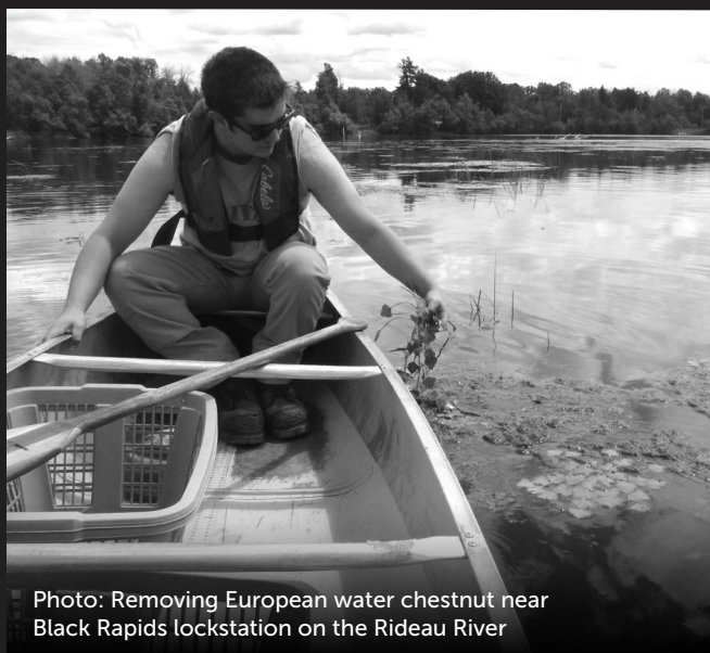
Photo: Removing European water chestnut near Black Rapids lockstation on the Rideau River

The Black Rapids lock station area on the Rideau River received a "spit-shine" as invasive water chestnuts were removed from the water this July. This removal effort was part of a long-term management plan with RVCA, Ducks Unlimited, and Parks Canada. We are seeing steady declines in plant numbers thanks to the ongoing efforts of removal by the partners over the past six years. This plant has earned its way onto the Invasive Species Act because of the number of environmental impacts it causes. Right now, it's been identified only in a few locations in Ontario, so it's crucial to stop the spread now. It's notorious for forming dense floating mats of vegetation that shade our native species and, it decreases plant biodiversity. Swimming, boating, and fishing in affected areas are almost impossible. When dead, the decomposing plants reduce oxygen that can cause fish kills. And, if that's not enough, they produce hard spiny nuts that can cause injury when stepped on. Ouch! Contact ROSARIO for details at rosario.castanon.escobar@rvca.ca .