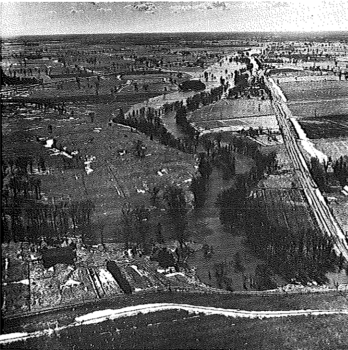
FIG. A-3 - UPSTREAM VIEW TOWARDS TWIN ELM AT MILEAGE 6.2. (NOTE TREE-LINED BANKS)