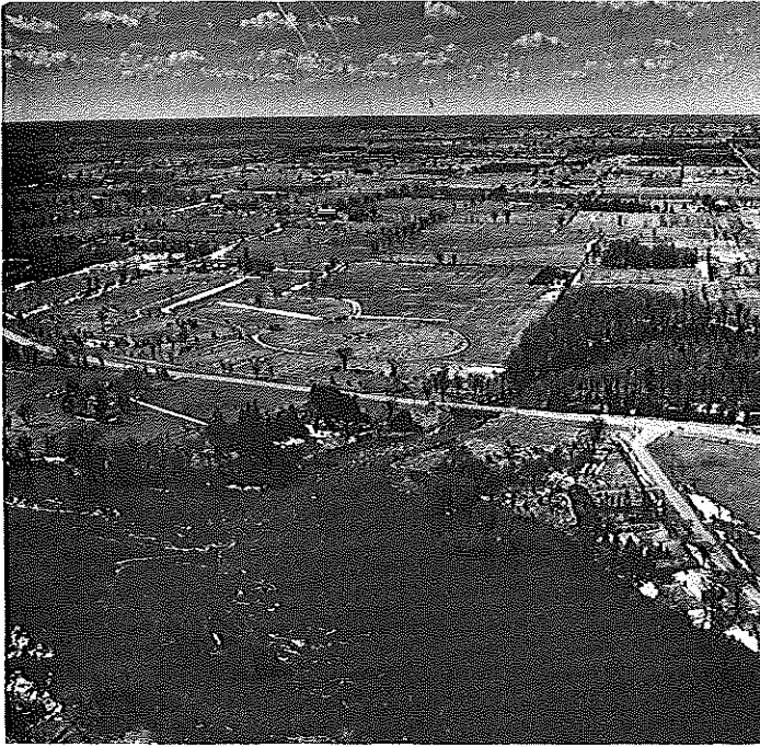
FIG. A-1 - ENTRY OF THE JOCK RIVER INTO THE RIDEAU RIVER