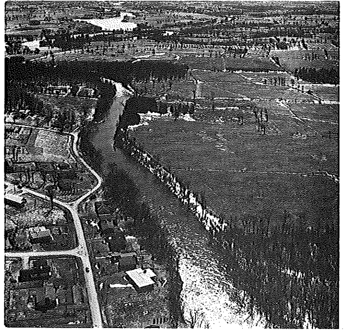
FIG. A-2 - DOWNSTREAM VIEW AT HEART'S DESIRE