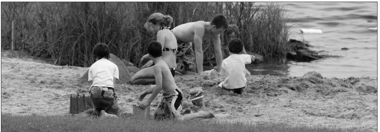
Native species enjoy beach habitat at Rideau Ferry Yacht Club Conservation Area

The Mississippi-Rideau Source Protection Committee (MRSPC) is hard at work preparing the information-laden Assessment Report due in September. This report brings together and summarizes all the technical work of the past five years identifying the vulnerable areas and activities that could have an impact on the health of the water supplying 12 municipal drinking water systems in the two valleys. The MRSPC is scheduled to approve a draft of the document for public consultation in June. The final step is to use this report to develop the Source Protection Plan itself which will detail the ways and means of long term protection of sources of municipal drinking water. More from Sommer at ext 1147 or sommer.robertson@mrsourcewater.ca .