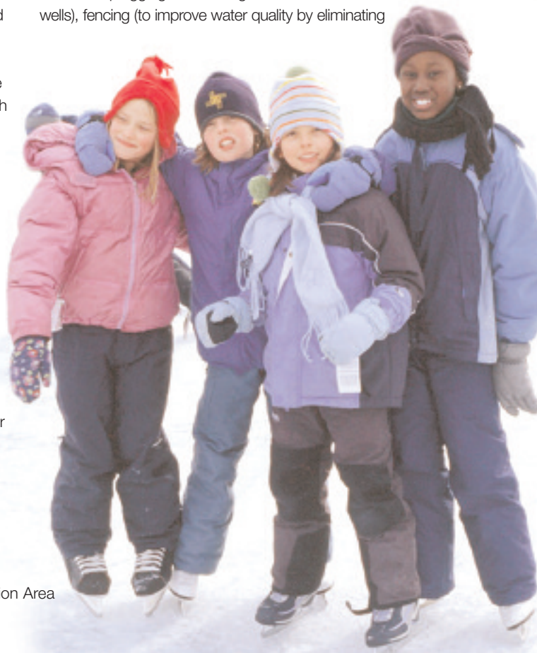
Winter fun at Baxter Conservation Area

2004 has been a busy year for the Rideau Valley Rural Clean Water Program (RVRCWP). The program offers financial incentives to farmers and rural property owners to undertake projects to protect and improve water quality along the Rideau and its tributaries. Types of projects funded include wells (improving and protecting groundwater by improving construction and maintenance of existing private wells, as well as plugging and sealing abandoned or dormant wells), fencing (to improve water quality by eliminating