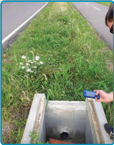
Swale in Parma, Ohio. The underdrain empties into an outlet structure (Ekka & Hunt, 2020).

A swale is a low-lying area that is engineered to move water away from roads and drainage channels. Similar to a ditch, swales have added benefits like reducing stormwater runoff, filtering pollutants and allowing stormwater to be slowly released into natural systems.